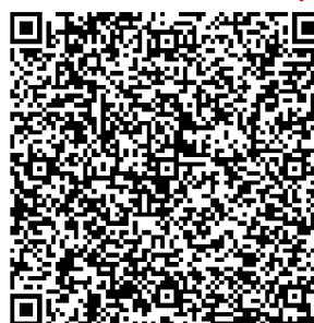
⑥ Miminashi District Community Center