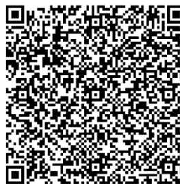
④ Yagi Junior High School Gymnasium