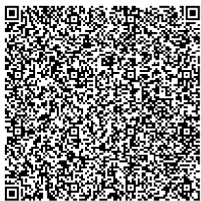
① Welfare center Yawaragi-no-sato